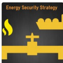
The Energy Security Strategy