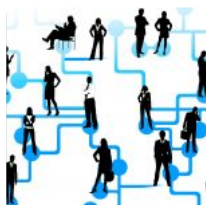
10 Tips for a Successful PR Campaign