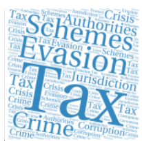
European Commission Anti Tax Avoidance Directive